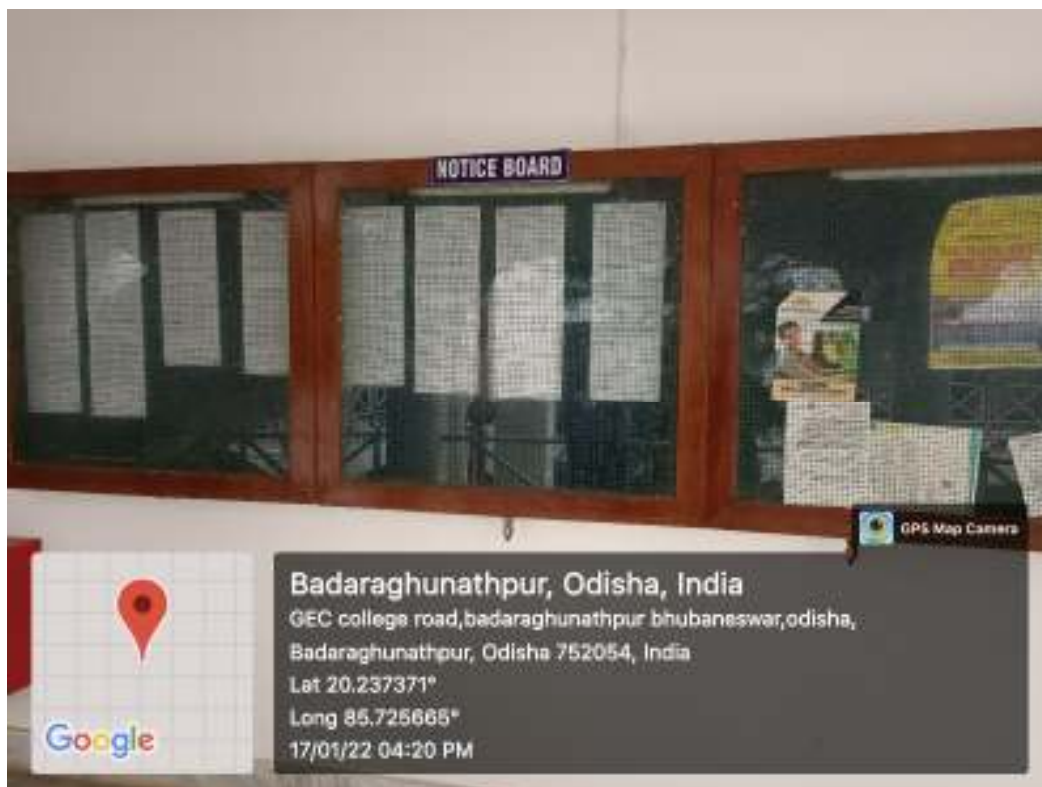
(Institute Notice Board for the Students)