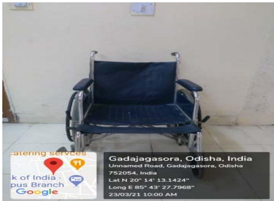
(Wheel Chair for physical abled students)