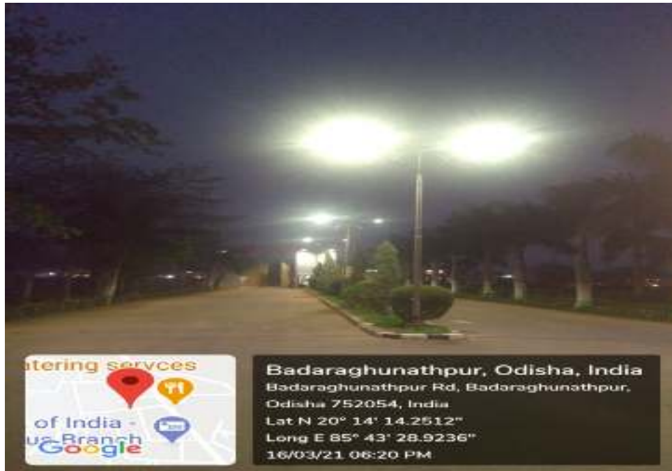
(Street Light during the night)