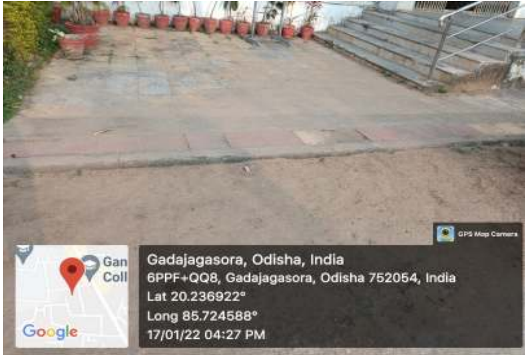
(Tactile Path at the Back side of the Academic Block)