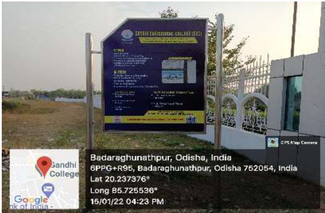
(Signage at the Main Entrance Gate No. 1)