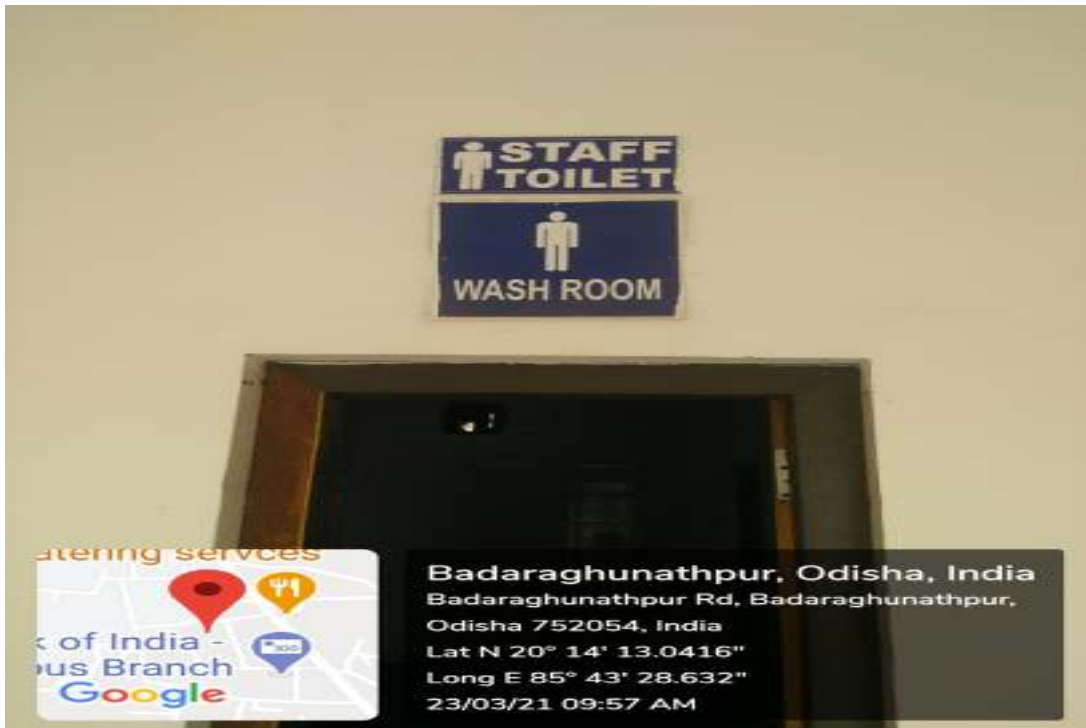
(Staff Toilet at 1 st Floor in the Academic Block)