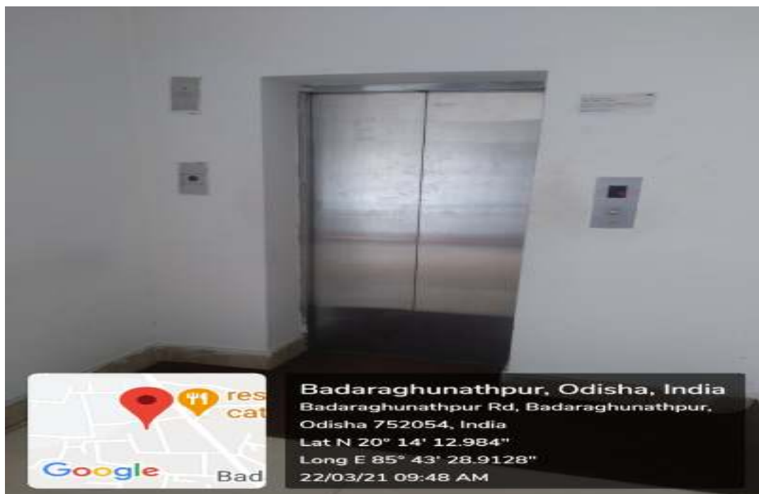
(Lift in the academic building)