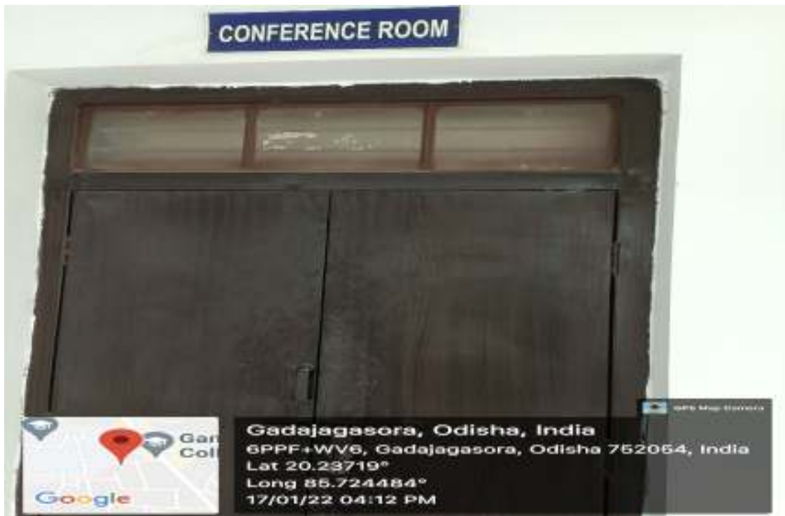
(Conference Hall at 3 rd Floor Academic Building)