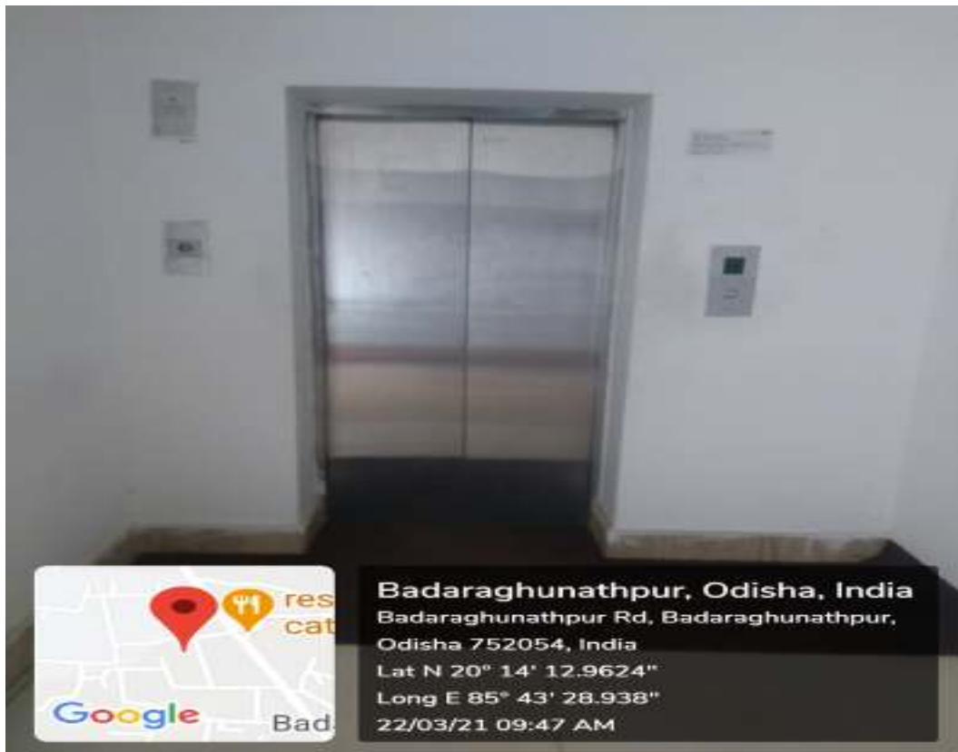
(Lift in the academic building)