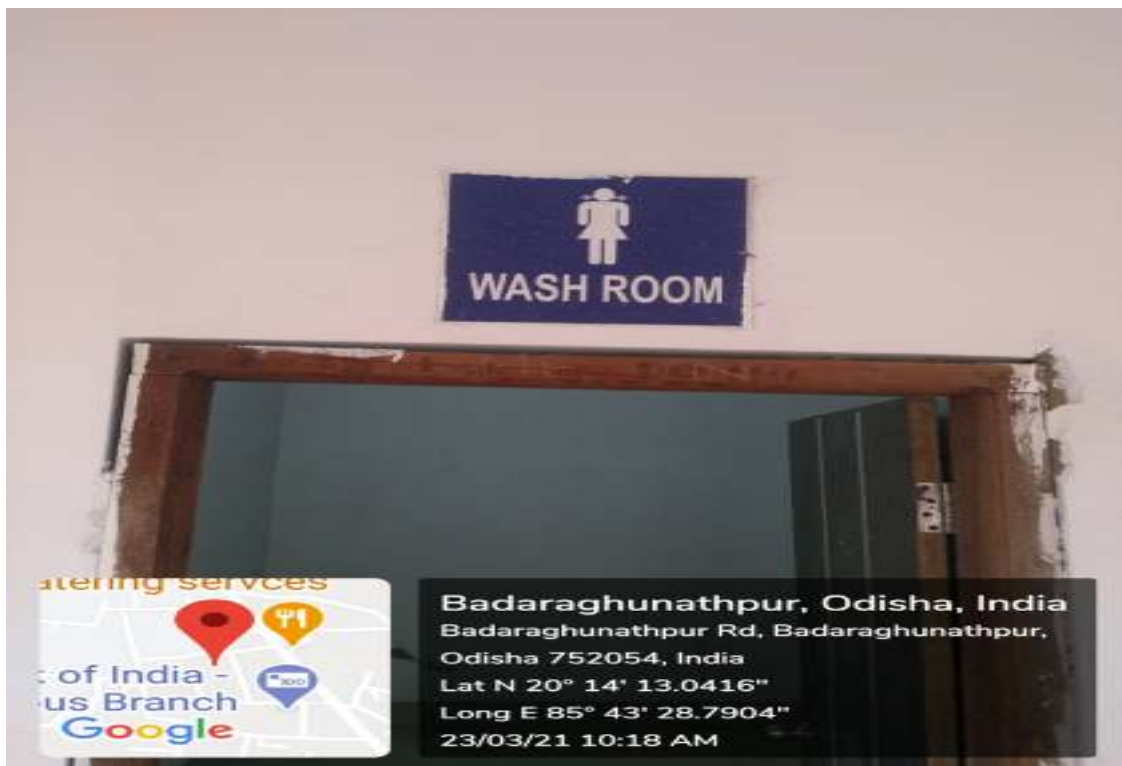
(Ladies Toilet at 4th Floor in the Academic Block)