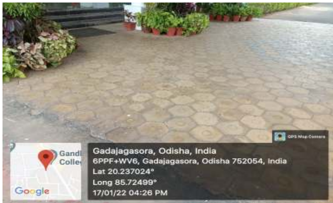
(Tactile Path at the Entrance of the Academic Block)