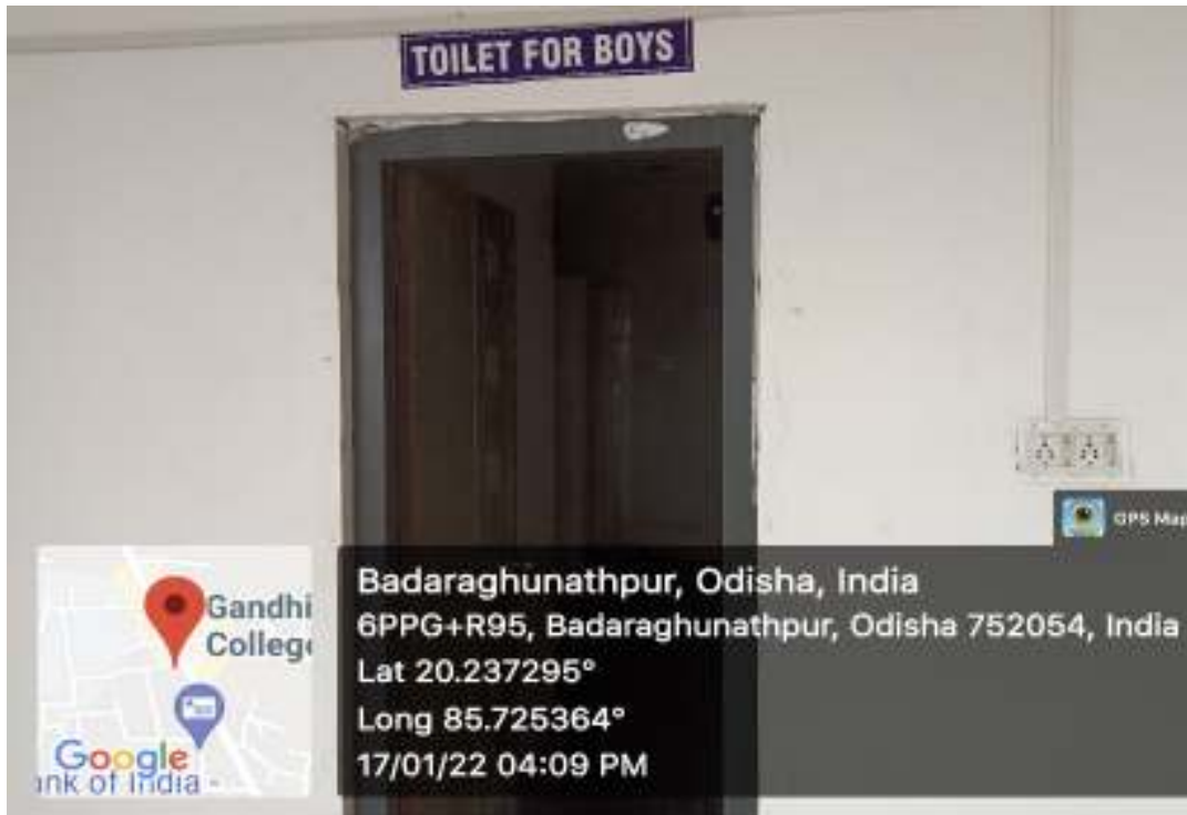
(Boys Toilet at 1 st Floor in the Academic Block)