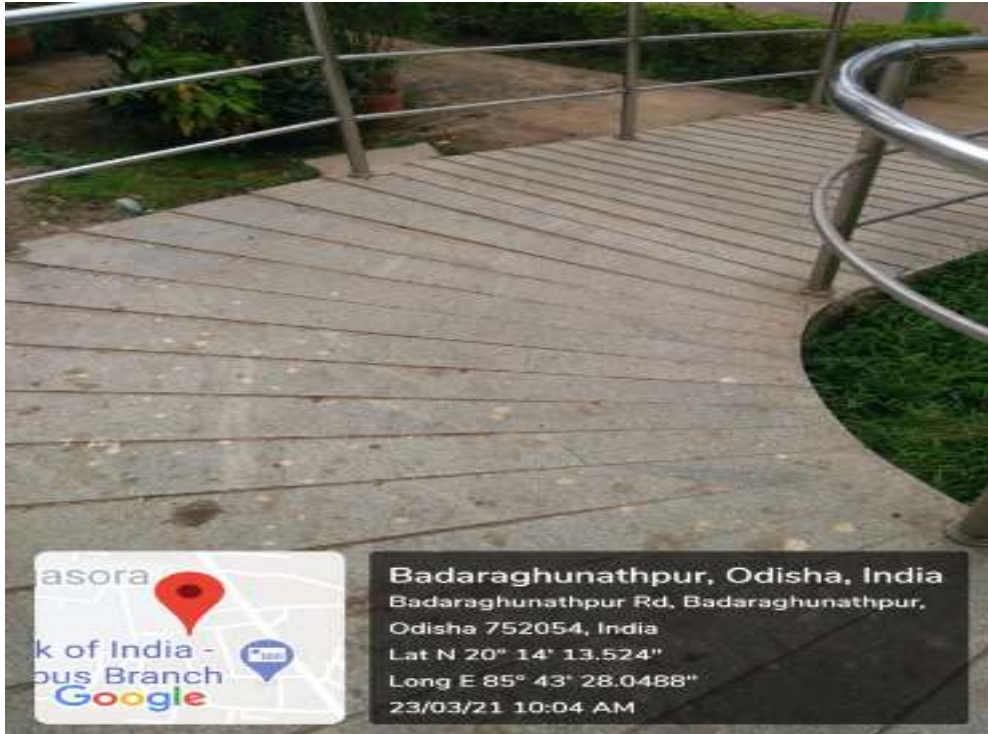
(Ramps in the academic block)