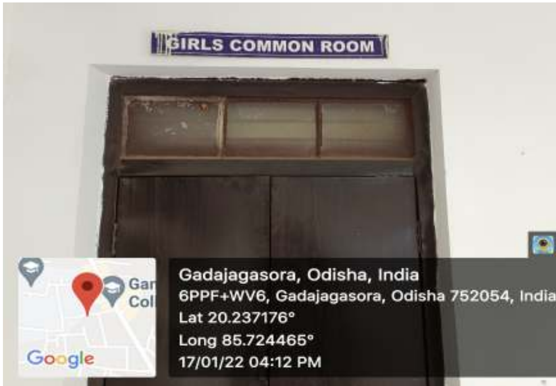
(Girls Common Room inside the Academic Building)