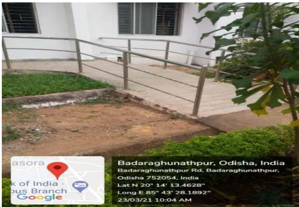
(Ramps in the backside of academic block)