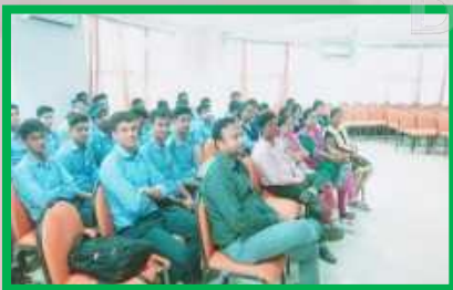
Technical paper presentation by Electrical students in RENEWABLE ENERGY SOURCES on 27/07/18