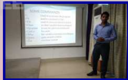
PPT presentation on SUMMER INTERNSHIP TRAINING by 5th semester Electrical Student on 03/08/18.