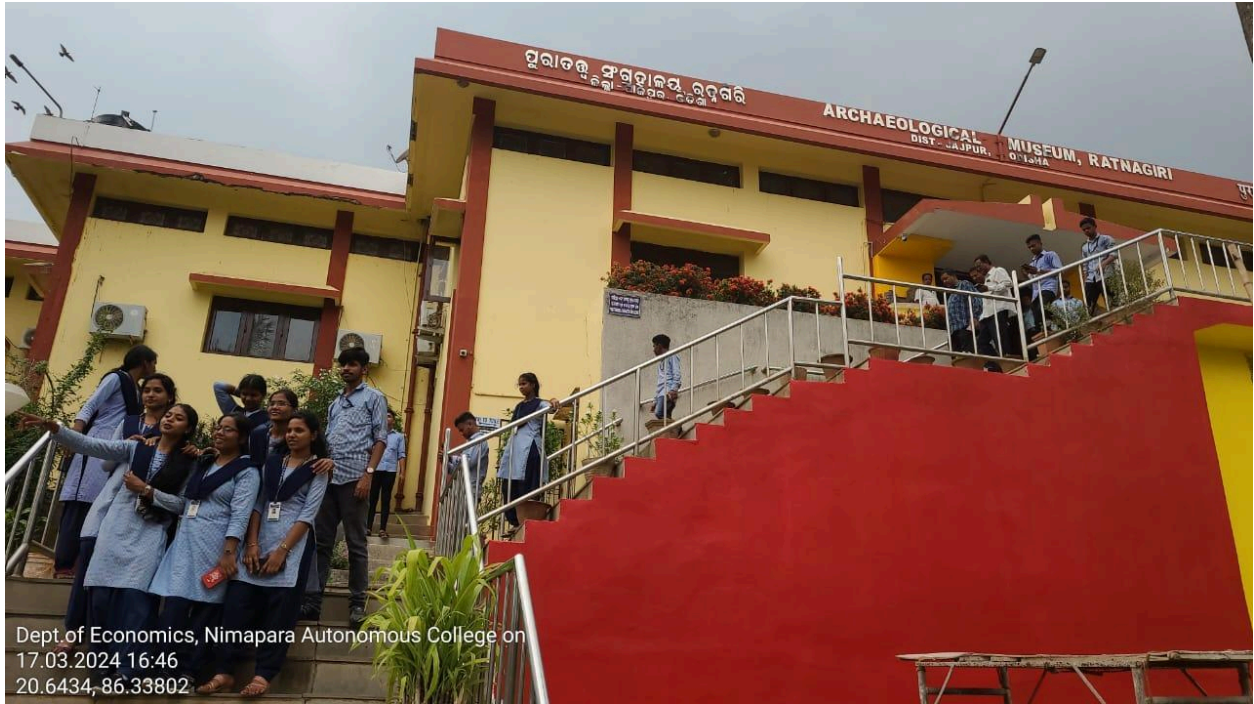
Dept. of Economics, Nimapara Autonomous College on 17.03.2024 16:46 20.6434, 86.33802