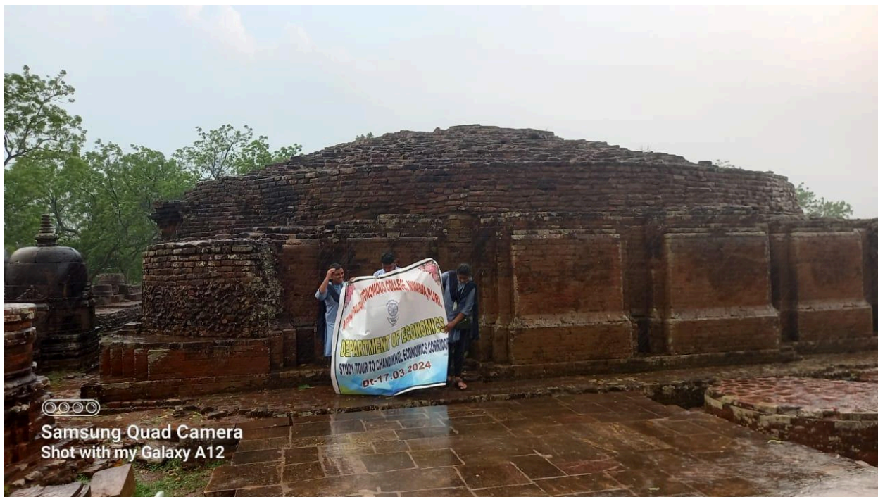
○○○○ Samsung Quad Camera Shot with my Galaxy A12