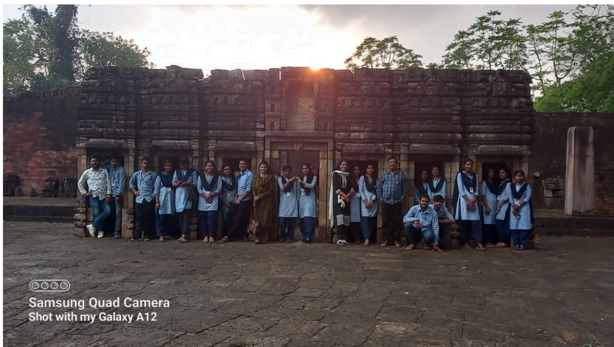
○○○○ Samsung Quad Camera Shot with my Galaxy A12